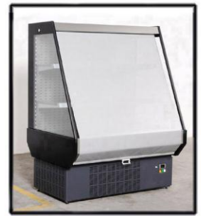
PULL DOWN NIGHT SHADE