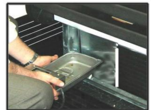
PULL OUT EVAP PAN FOR EASY CLEANING