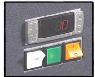
DIGITAL CONTROLLER WITH HIGH PRESSURE ALARM