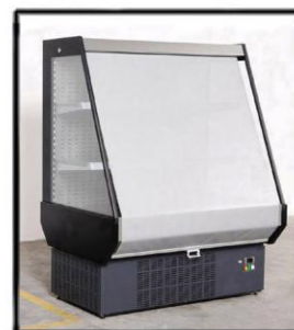
PULL DOWN NIGHT SHADE