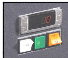
DIGITAL CONTROLLER WITH HIGH PRESSURE ALARM