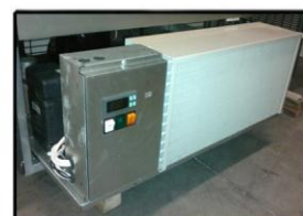
PULL-OUT CONDENSING UNIT, CONTROL PANEL AND EVAP PAN