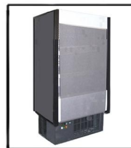
PULL DOWN NIGHT SHADE