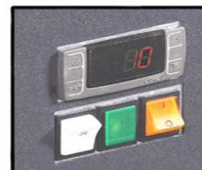
DIGITAL CONTROLLER WITH HIGH PRESSURE ALARM