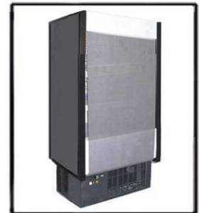
PULL DOWN NIGHT SHADE