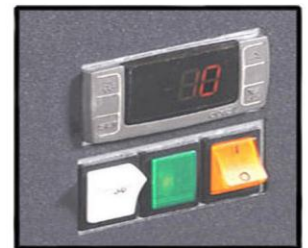
DIGITAL CONTROLLER WITH HIGH SIDE ALARM