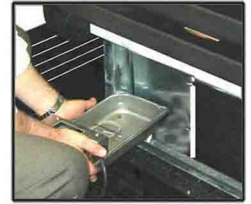
PULL OUT EVAP PAN FOR EASY CLEANING ON SELF CONTAINED