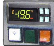
DIGITAL CONTROLLER WITH HIGH HEAD ALARM ON SELF CONTAINED