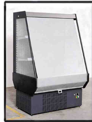
PULL DOWN NIGHT CURTAIN