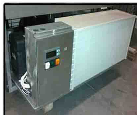
PULL OUT CONDENSING UNIT