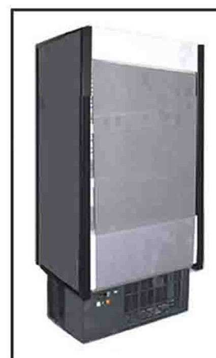
PULL DOWN NIGHT CURTAIN