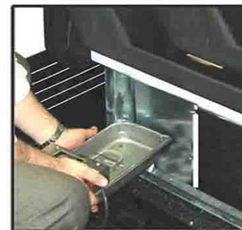
PULL OUT EVAP PAN FOR EASY CLEANING ON SELF CONTAINED