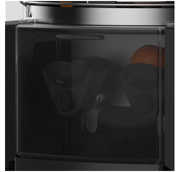
Smoky grey front cover