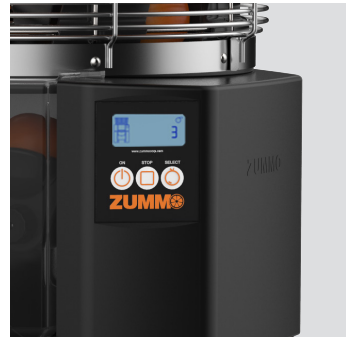
Higher juice extraction speed