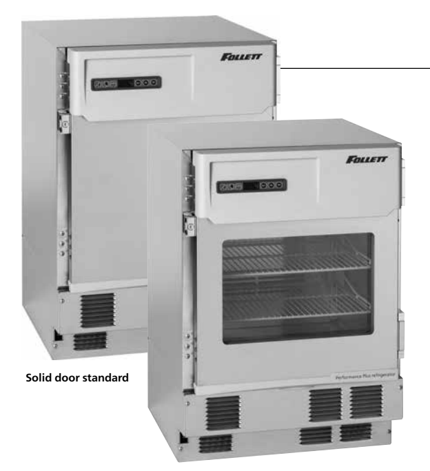
Optional glass door