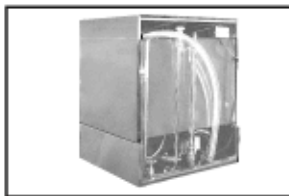
Pumped drain will drain uphill. Requires no floor drain.