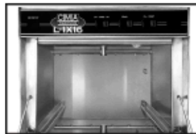
Upper and lower rotating wash arms guarantee excellent results.