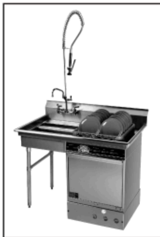
Optional dishtable, faucet and pre-rinse unit sold separately.