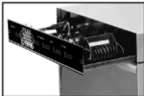
Convenient to service "Works-in-a-drawer", may be removed by unplugging one electrical connection.