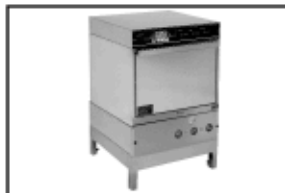
Optional pedestal allows the L-1X16 to be raised up to a full 12" off the floor for easy operator use. Height adjustable from 8" to 12".