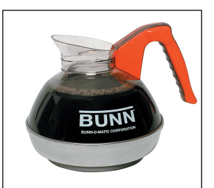
EASY POUR,(ORN) 1/CS