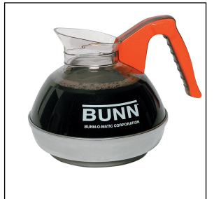
EASY POUR,(ORN) 3/CS