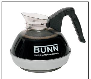
EASY POUR, (BLK) 2/CS