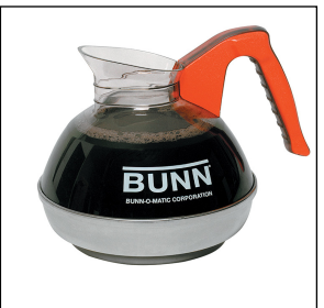
EASY POUR,(ORN) 24/ CS