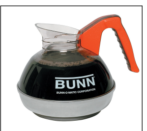
EASY POUR,(ORN) 2/CS