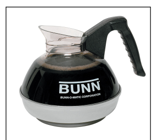
EASY POUR, (BLK) 6/CS