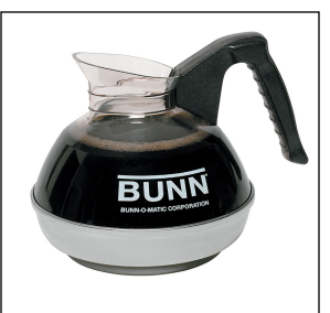
EASY POUR,(BLK) 1/CS