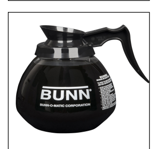
DECANTER,GLASS-BLK 12CUP 1PK