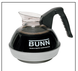
EASY POUR, (BLK) 24/CS