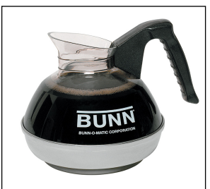
EASY POUR,(BLK) 3/CS