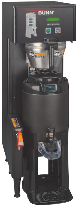
Single TF DBC with 1.5 gallon TF Servers* (servers sold separately)

Dimensions: 35.7" H x 12.1" W x 19.2" D (90.7cm H x 30.7cm W x 48.8cm D)