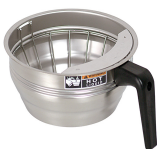
FUNNEL ASSY,SST-BLK HDL(7.62