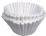
FILTERS,REGULAR1M 500/2 50/CL