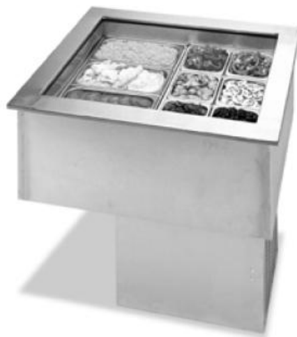
Model: Drop-In Cold Well