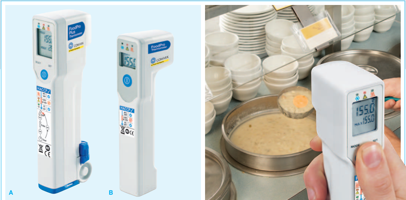
A: FoodPro Plus infrared thermometer with probe and countdown timer B: FoodPro infrared thermometer